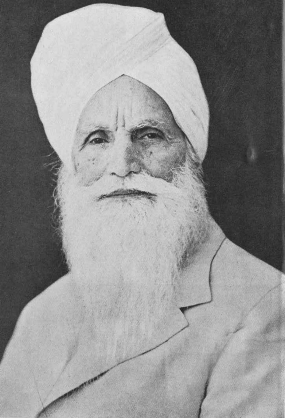
HUZUR MAHARAJ BABA SAWAN SINGH JI 1858-1948